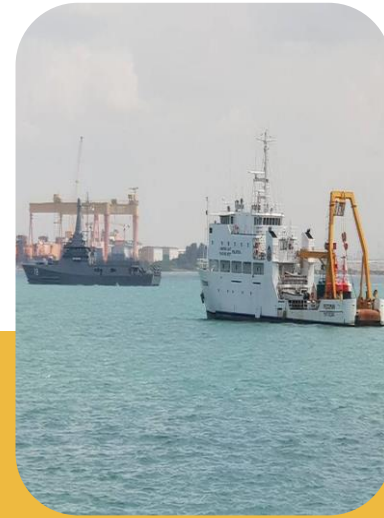
Incursions into Singapore Territorial Water, 2018