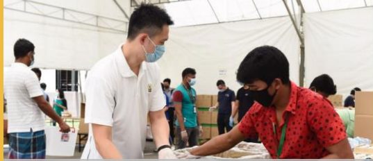
FORWARD ASSURANCE & SUPPORT TEAMS (FAST) AT MIGRANT WORKER DORMITORIES