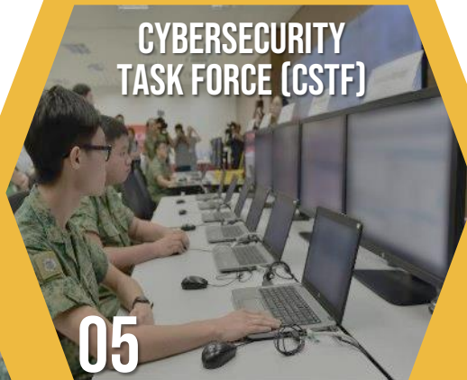
CYBERSECURITY TASK FORCE (CSTF)

The newly restructured CSTF will strengthen our ability to monitor and actively seek potential threats and aggressors in the cyber domain.