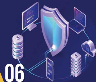
HARNESSING NEW TECHNOLOGIES

The SAF is also leveraging Artificial Intelligence (AI), data analytics and robotics across all three Services.