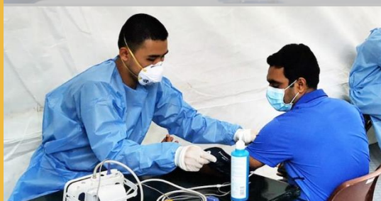
PROVIDING MEDICAL CARE TO RECOVERING PATIENTS