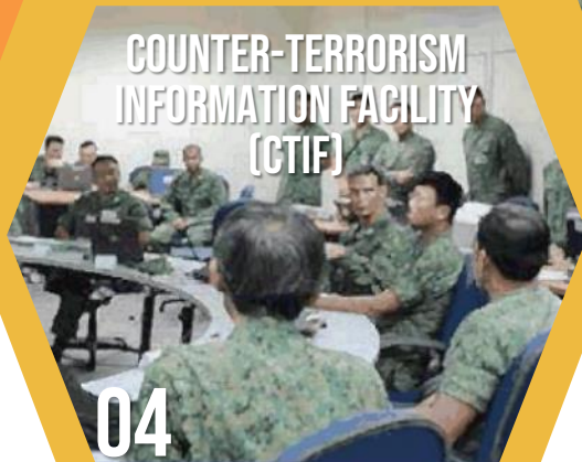
COUNTER-TERRORISM INFORMATION FACILITY (CTIF)

To strengthen efforts to counter terrorism, the multilateral CTIF will bring together like-minded countries to share intelligence, and provide early warning, monitoring and analysis capabilities in a centralised and coordinated manner.