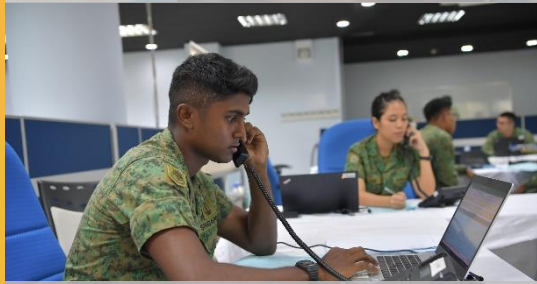
SUPPORTING CONTACT TRACING & COORDINATING QUARANTINE OPERATIONS