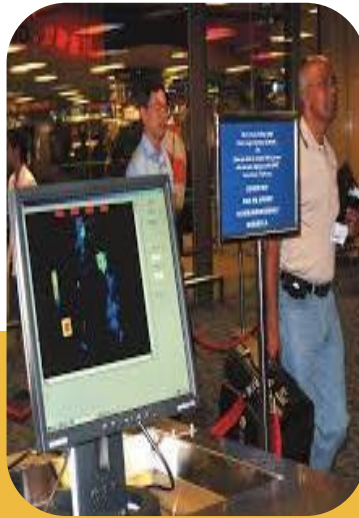
SARS crisis, 2003