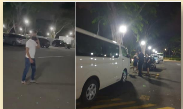
Indian man shouted racist remarks and assaulted Chinese youth at East Coast Park.