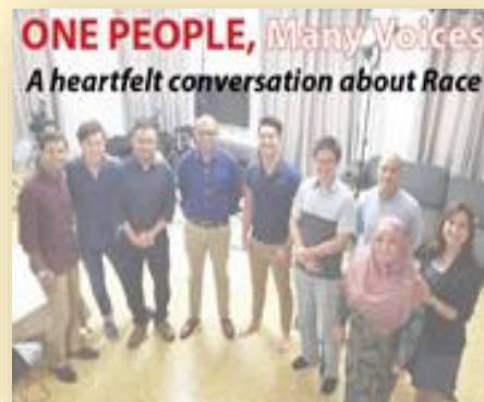
Taking part in online and offline dialogues and discussions.