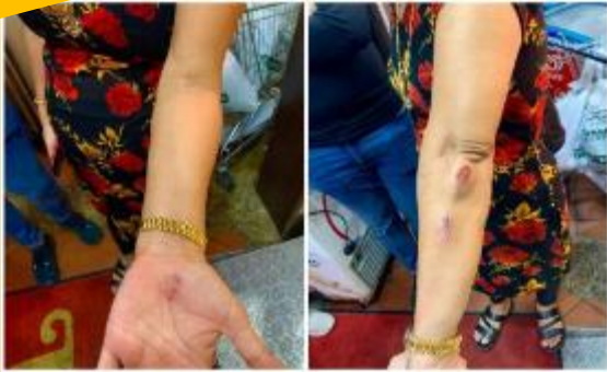
55-year-old Indian woman called racist slurs and kicked by Chinese man.