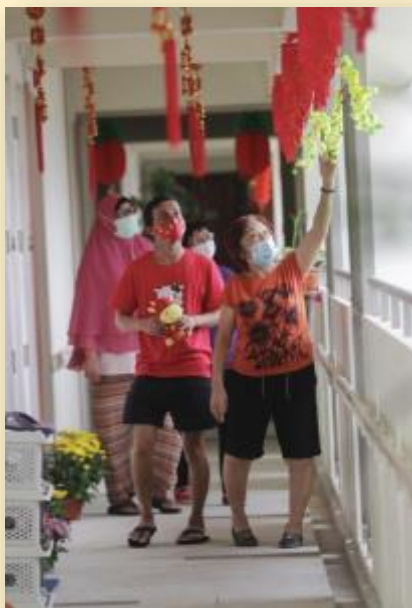
Malay residents put up CNY decorations at Tampines block corridor for elderly neighbours.