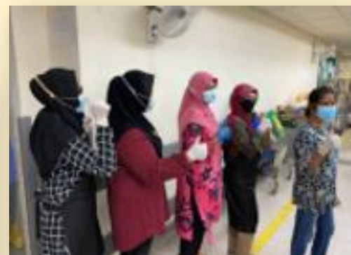
Project Co-Knit with Love: Singaporeans knitted mask extensions for tudung-wearing Muslim women.