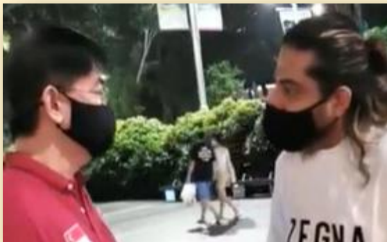
Chinese man makes racist remarks towards inter-racial couple.