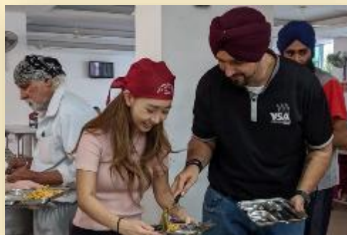
Sikh group invites influencer to learn more about their traditions after her viral remarks about two men wearing turbans.