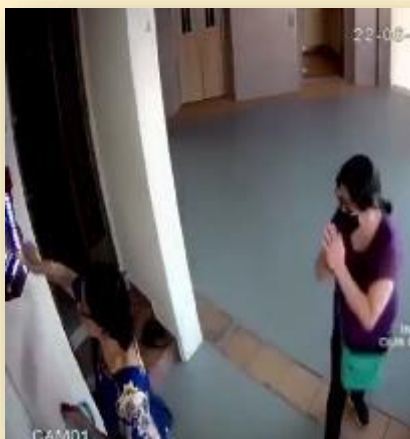
Chinese woman passing by HDB corridor clasps hands to pay her respects to Indian resident's deity.