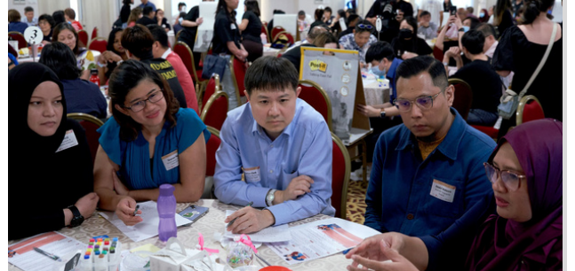
Participants at one of the Forward SG engagement sessions