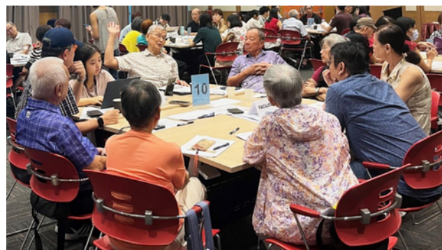
Participants at one of the Forward SG engagement sessions (Forward SG Full Report)

In 2030, I hope Singapore can embrace the challenges faced by families that have a child born with high medical needs. My wish is for society to be willing to provide more help to ease the difficulties of lifelong caregiving for individuals with more needs - a situation that we had not chosen to be in but nonetheless have embarked on.