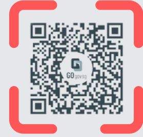
Resignations of Speaker Tan Chuan-Jin and MP Cheng Li Hui