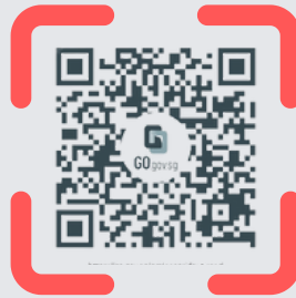
The ridout road rentals

Scan the QR codes to read PM Lee's responses to: