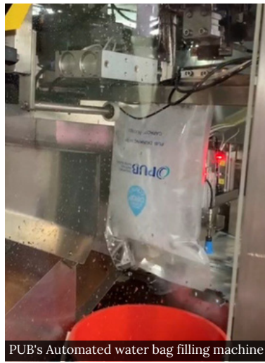
PUB's Automated water bag filling machine