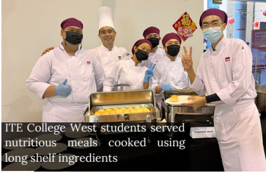
ITE College West students served nutritious meals cooked using long shelf ingredients