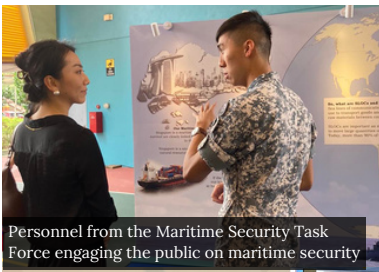
Personnel from the Maritime Security Task Force engaging the public on maritime security