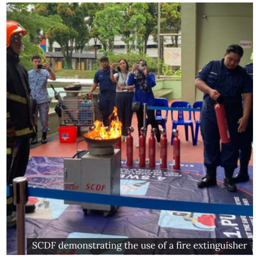
SCDF demonstrating the use of a fire extinguisher

3. TD Tower Defence Game: Currently in the prototype stage, the game is designed and coded by a group of NUS High School of Math and Science students. It adds a TD-themed twist to the classic tower defence game, a popular sub-genre of strategy games where players allocate resources to build towers to defend their territories against enemy attacks.