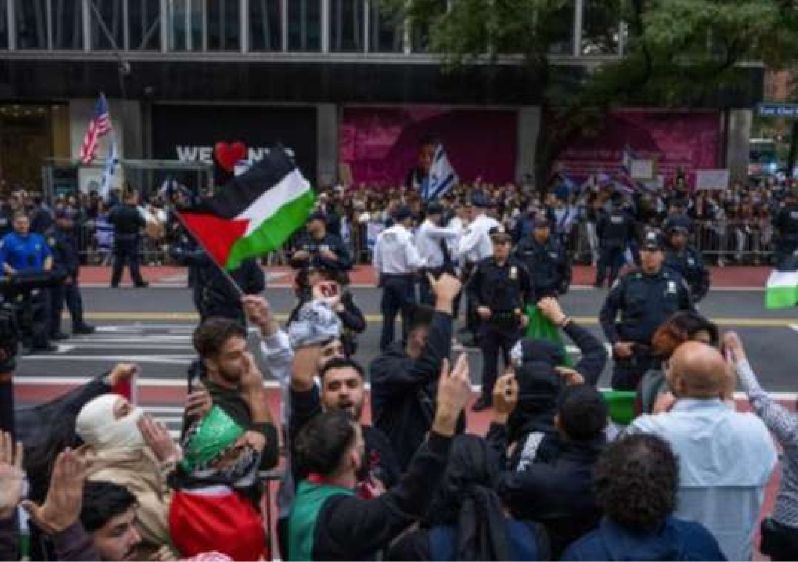
Opposing groups protesting in New York City outside the Israeli Consulate on 8 Oct, 2023.