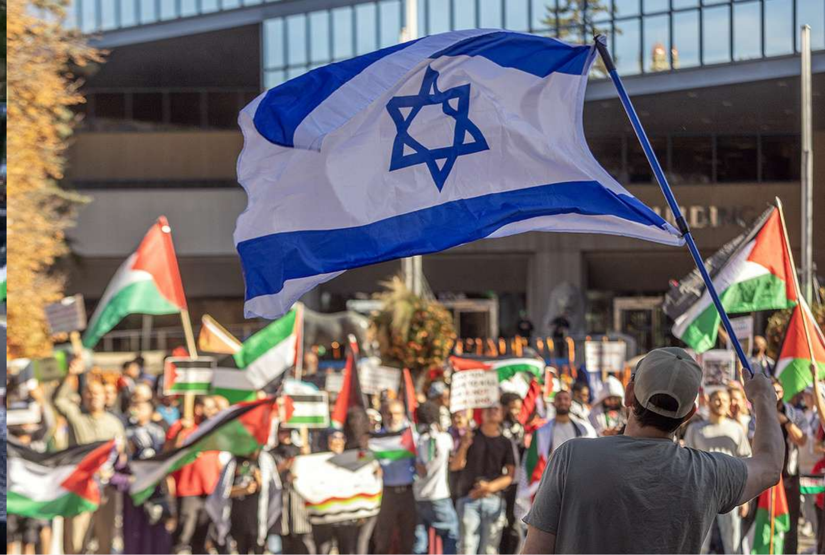
A lone pro-Israel counter-protester waves an Israeli flag against pro-Palestinian protesters at Calgary City Hall on 9 Oct, 2023.